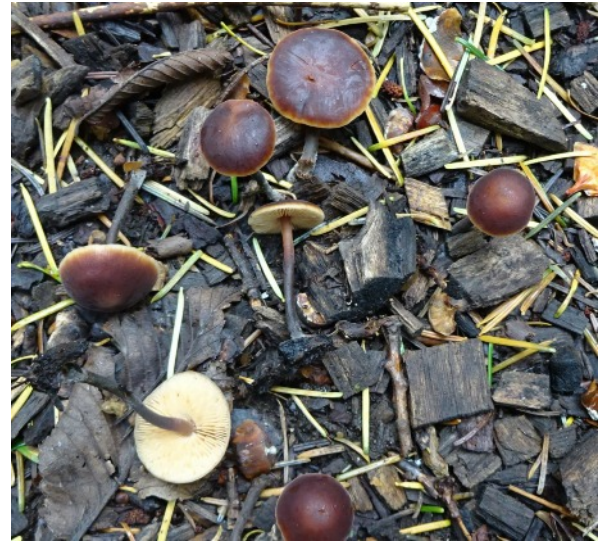
Macrocyttidia cucumis (above) growing on wood debris (smells of cucumbers and has very large cystidia)