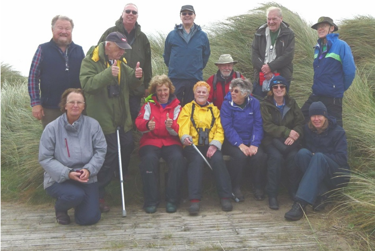
Members of NWFG and the Isle of Man Fungus Group

We had a great time thanks to the excellent choice of sites and hard work put in by the local organisers.