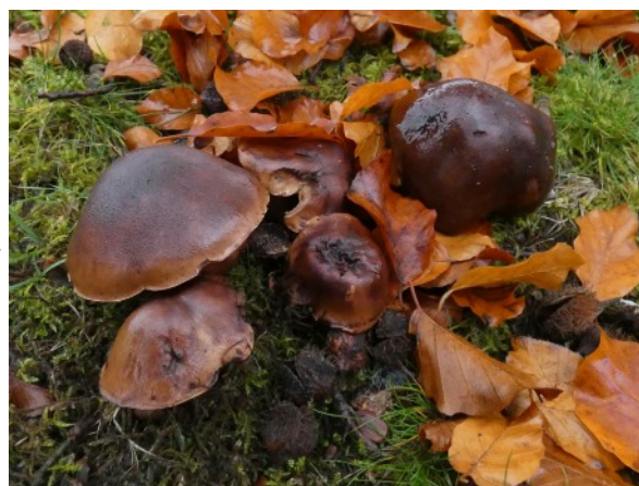
Tricholoma ustale Burnt Knight