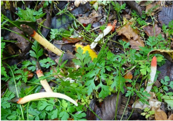
Mutinus caninus (Dog Stinkhorn) at Milntown House