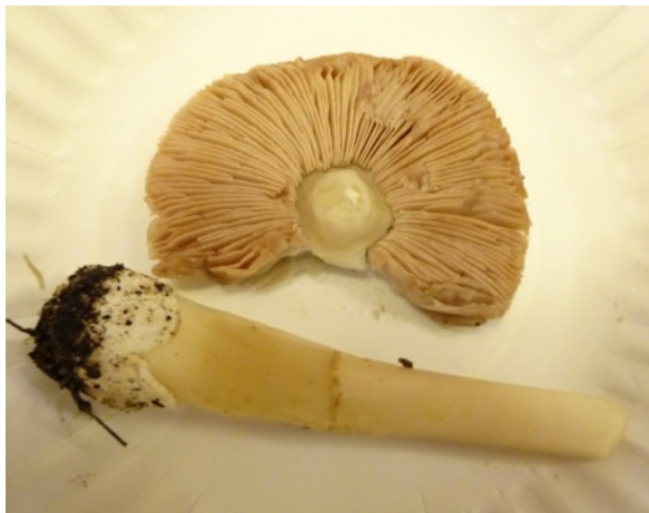
Volvopluteus gloiocephalus (Stubble Rosegill)