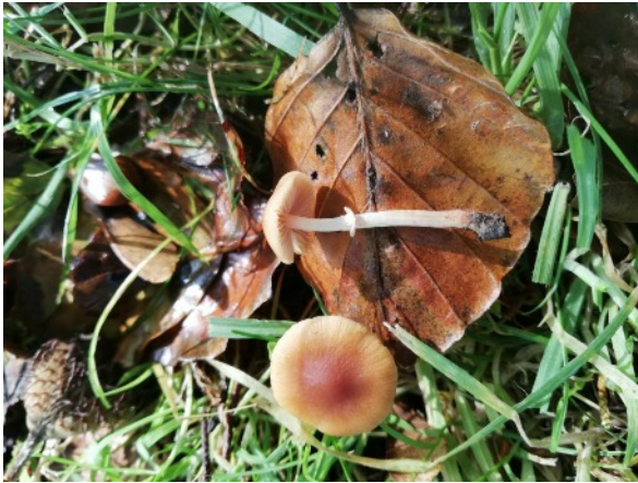
Pholiota arrhenii (Ringed Conecap)