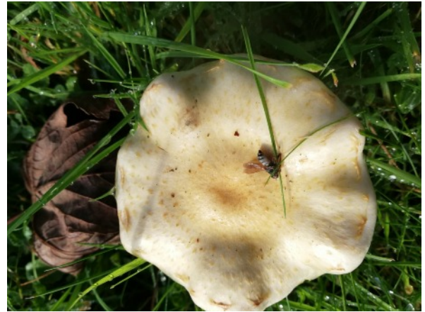
Pholiota gummosa (Sticky Scalycap) with Entomophthora muscae